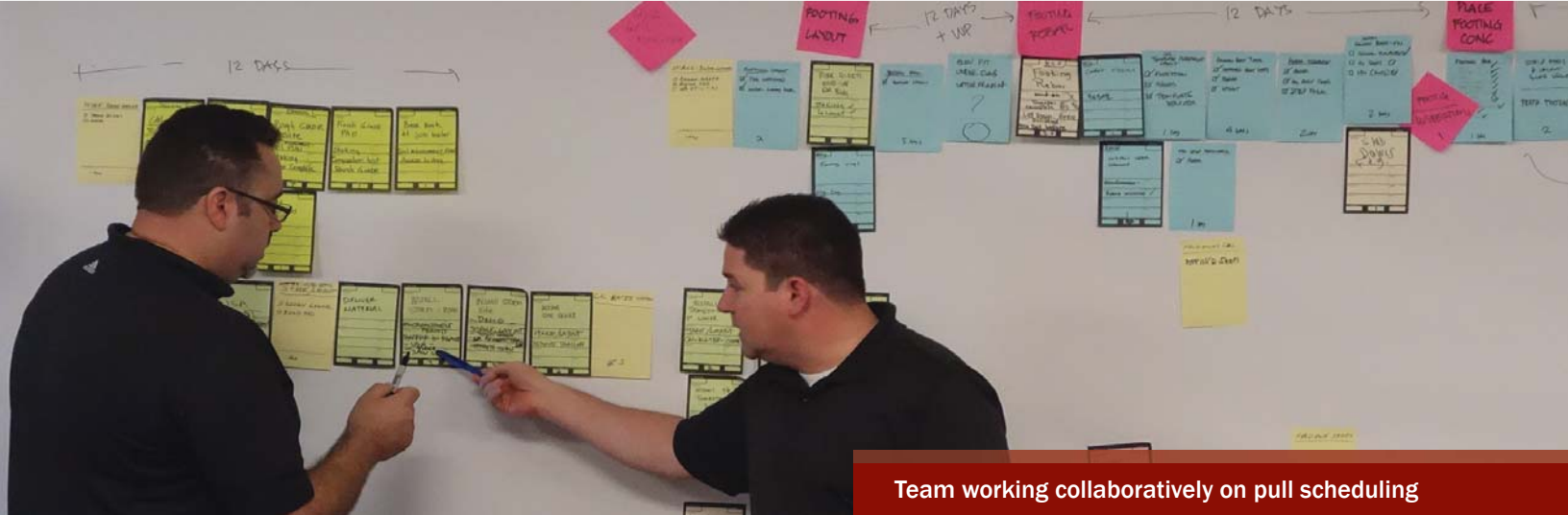
Team working collaboratively on pull scheduling

TVD requires that the client determine a maximum allowable cost. Based on this benchmark, a target cost is set below the project's threshold. The goal is to challenge the entire project team (client, design professional and general contractor) to increase innovation during the design and construction process. The resulting efforts create a more collaborative process and design/construction solutions to maximize value.